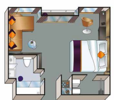
Suite Mozart Deck (284 sf)