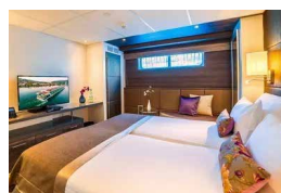
Stateroom Haydn Deck (172 sf)

Notes - Excursions require moderate walking with some stair climbing possible. -Hotel/Ship Check in time in Europe typically begins between 3-4 pm.