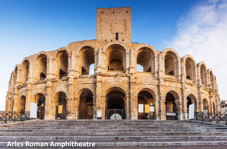
Arles Roman Amphitheatre